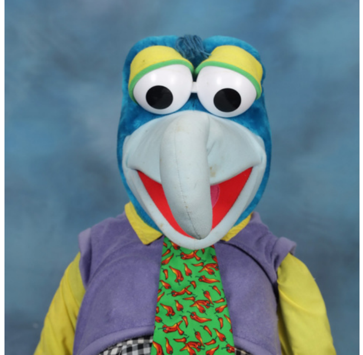
OCE Gonzo's yearbook photo. Can YOU solve the mystery?